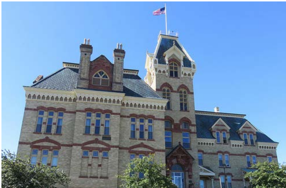
Houghton County Courthouse

The county's population is concentrated in the northern half of the county. This includes two primary population centers, 1) the Cities of Houghton and Hancock, opposite each other on Portage Lake/Canal near the center of the county, and 2) the Villages of Calumet and Laurium in the northern tier of the county. The City of Houghton is the County seat.