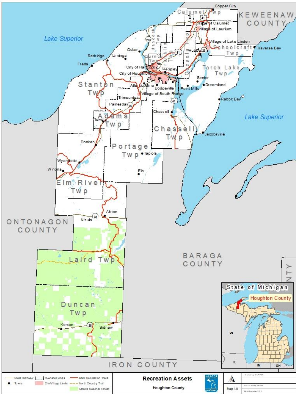
Figure 1: Regional recreation facilities