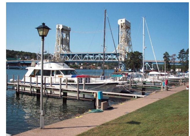
Houghton County Marina

More than just an item on a checklist, universal design is an integral part of recreation facility development. The approach helps to maximize the return on investment in recreation by making facilities as safe and user-friendly as possible. Assessments were completed by members of the Houghton County Recreation Committee with support by WUPPDR staff.